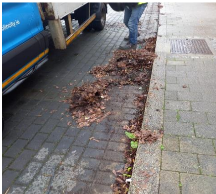
Ballymun Main Street, Trinity Comprehensive

The areas photographed Ballymun Main Street (Trinity Comprehensive), Shangan Park, St Margaret's Road, Finglas Road.