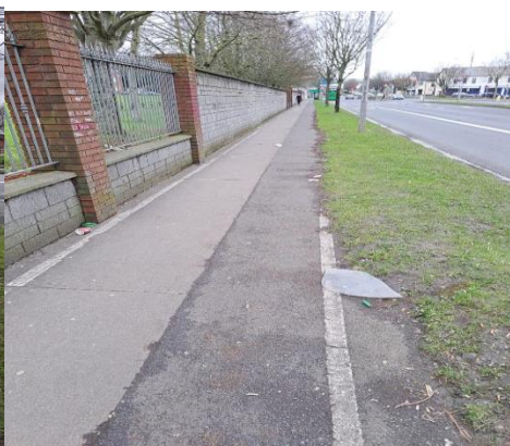
Saint Margaret's Road